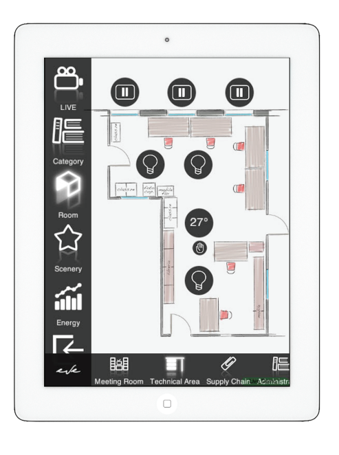
MAP style: Graphical pages navigation, free icon positioning, resizableicons, free design.